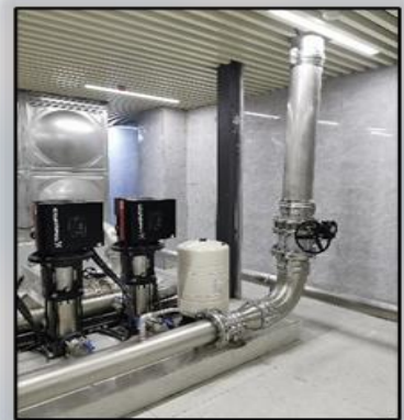
Water System Specifications: DN 20-DN200mm