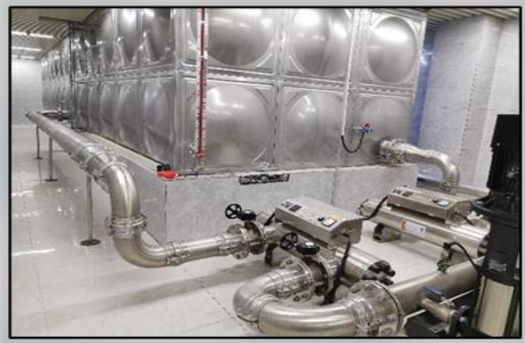
Water System Specifications: DN 80-DN200mm

Shown below are two different projects in Hangzhou City. We are proud to demonstrate the robust high-end quality of our AQUApipe line as it is trusted by many water facilities across the globe.